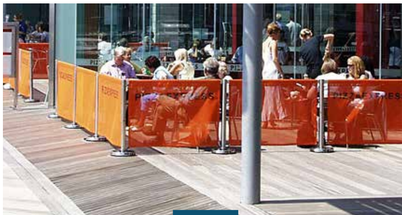
ORIGINAL: Portable Range 97 SmartScreens with bases and breathable mesh panels.