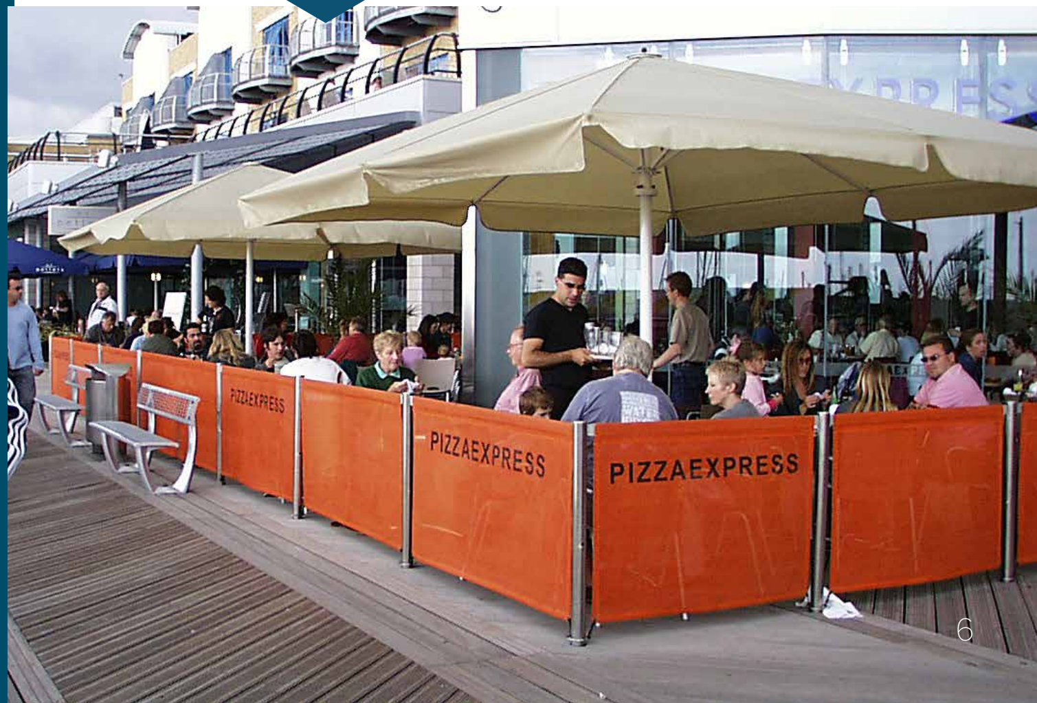
UPGRADE: Range 97 SmartScreens, with posts in deck sockets