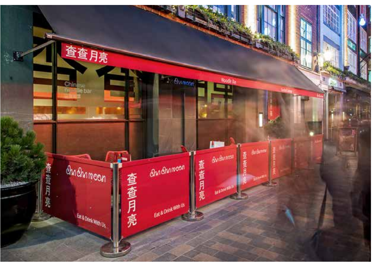
Café Screens at Cha Cha Moon, Soho