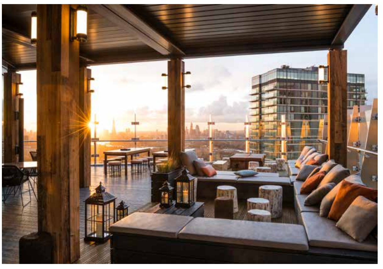
Tilting, retracting louvred roof - Bōkan, Canary Wharf