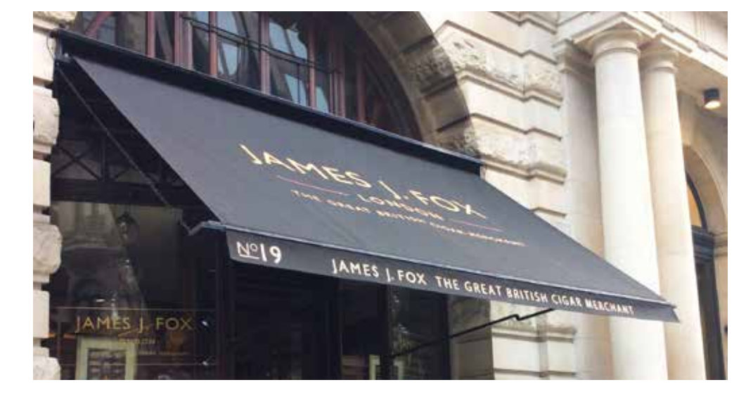
VICTORIAN AWNINGS Manual drop-arm awnings perfect for traditional shop front and listed buildings.